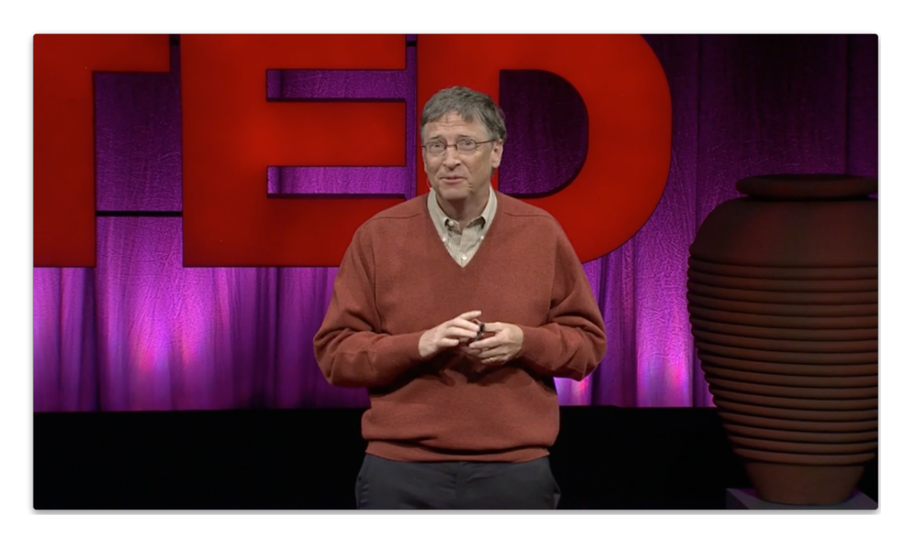
Camera 3: As with Camera 1, use this camera for long-shots with the speakers and slides when they look away from the lens and medium shots from the waist up when they look toward it: